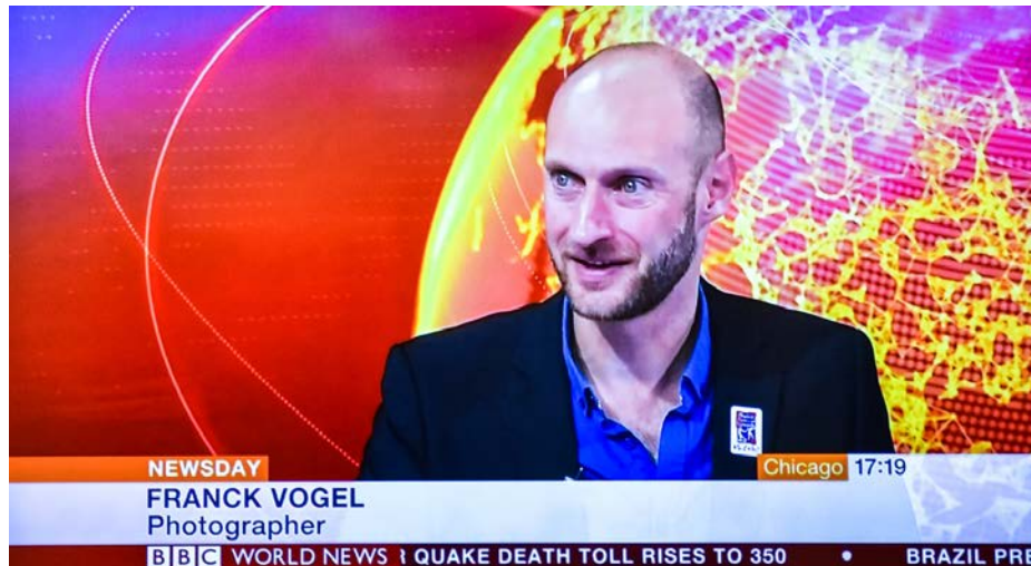
5 min live interview from the BBC studios in Singapore (16 April 2016 - Audience 400 million)