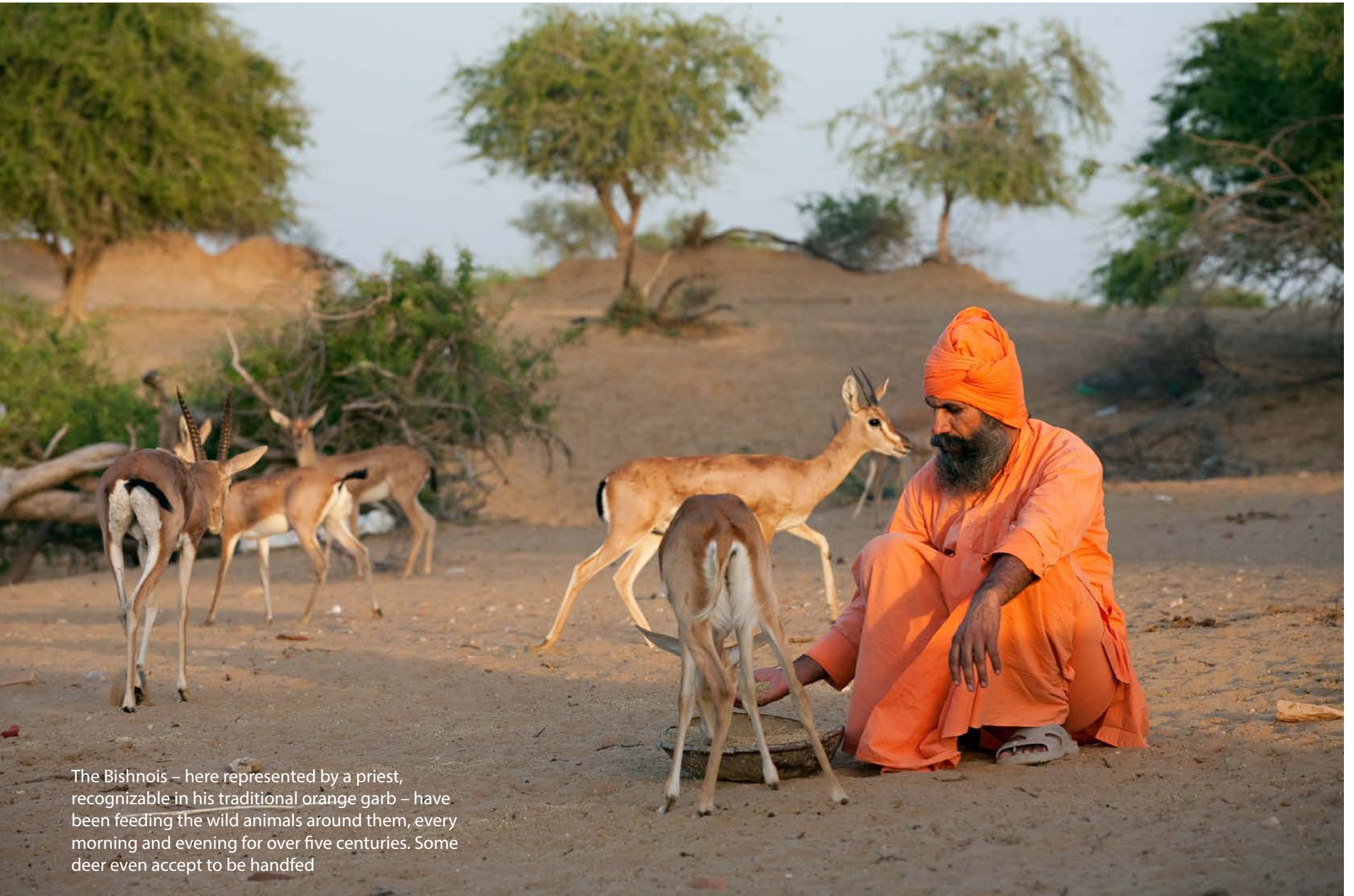
The Bishnois – here represented by a priest, recognizable in his traditional orange garb – have been feeding the wild animals around them, every morning and evening for over five centuries. Some deer even accept to be handfed