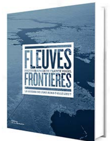
FLEUVES FRONTIERES (Transboundary Rivers) La Martinière Publishing (2016)