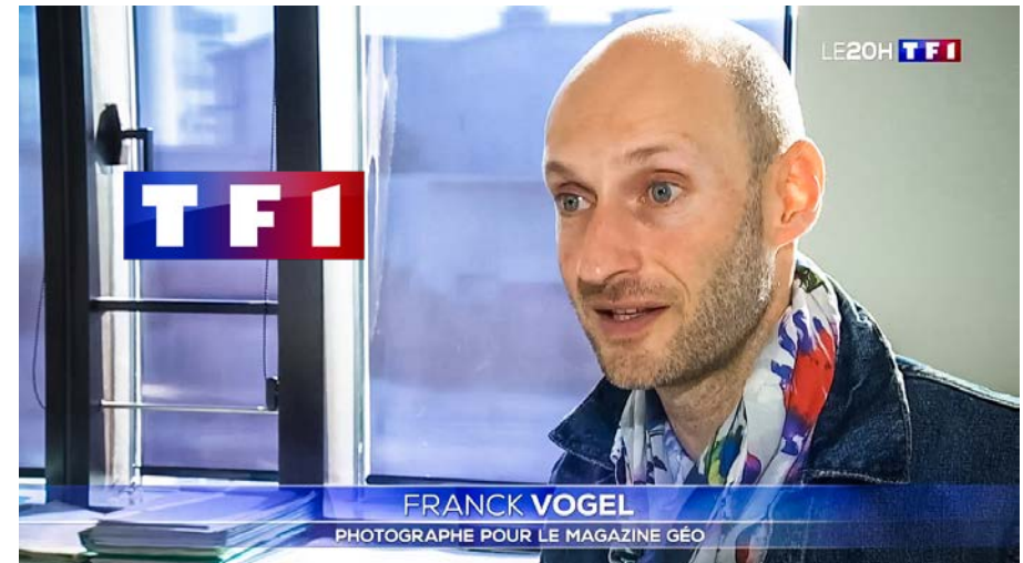
Interview on TF1 evening news « Le 20 h » (8 October 2018 - Audience 5,76 million)